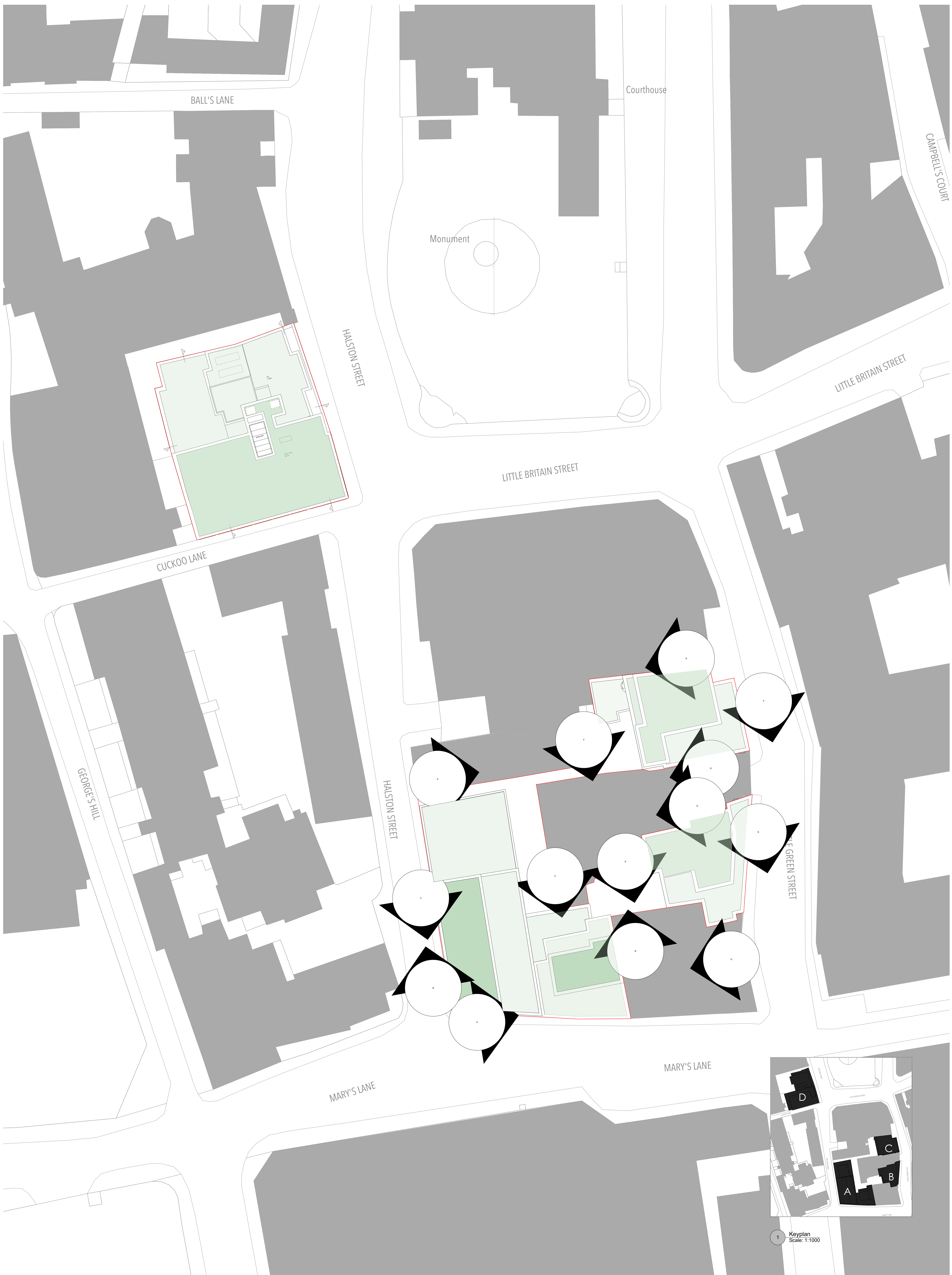
1 Proposed Roof Plan Scale: 1:200