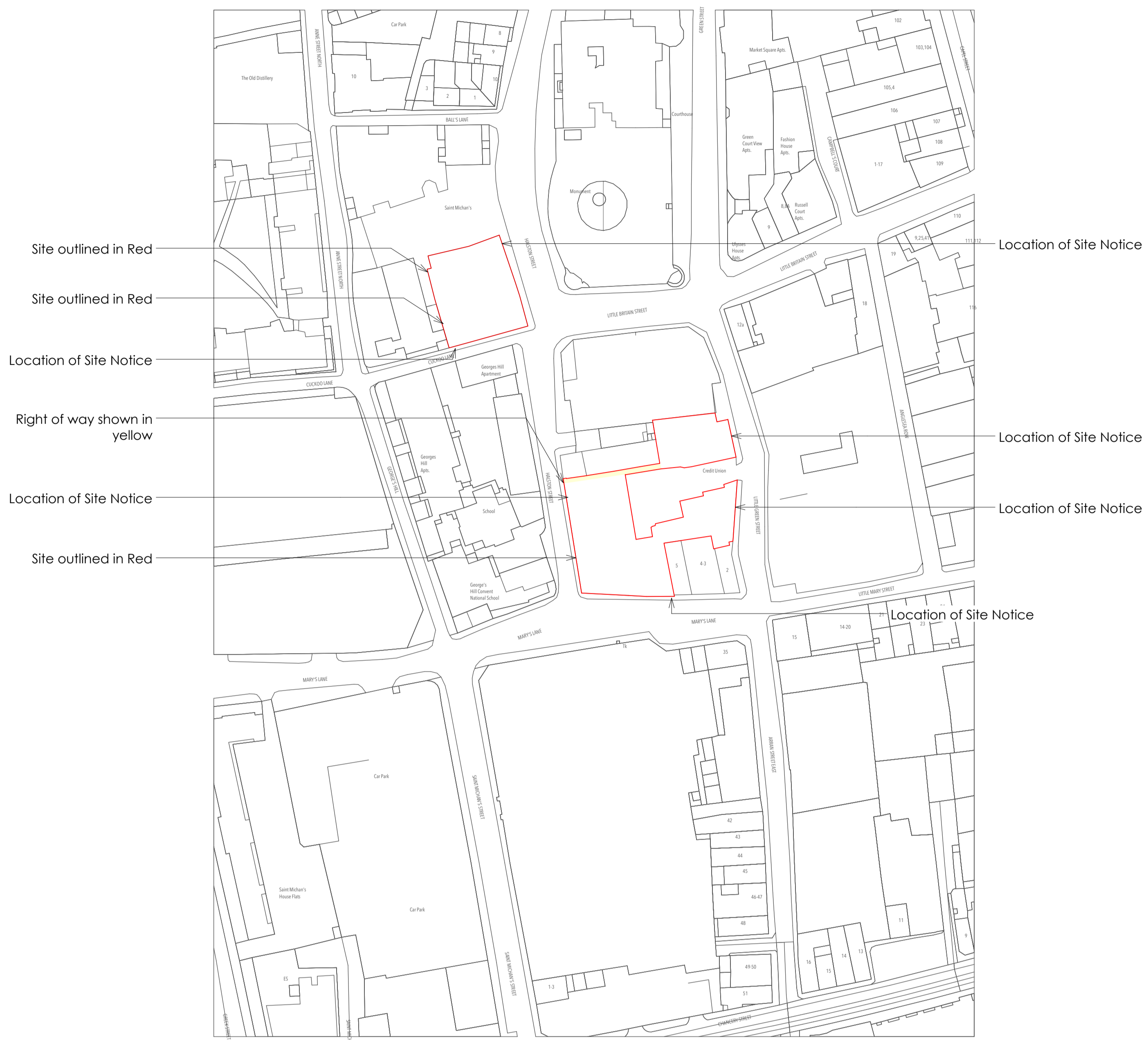
1 Site Location Map- OS Map Scale: 1:1000

Outline of Sites SITE AREA TOTAL = 2465sq. m.