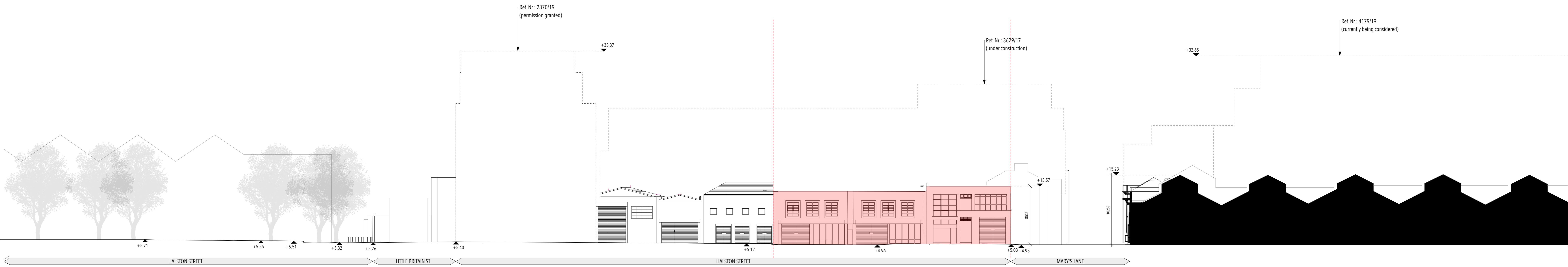
1 Existing Contextual Elevation A-A Scale: 1:200