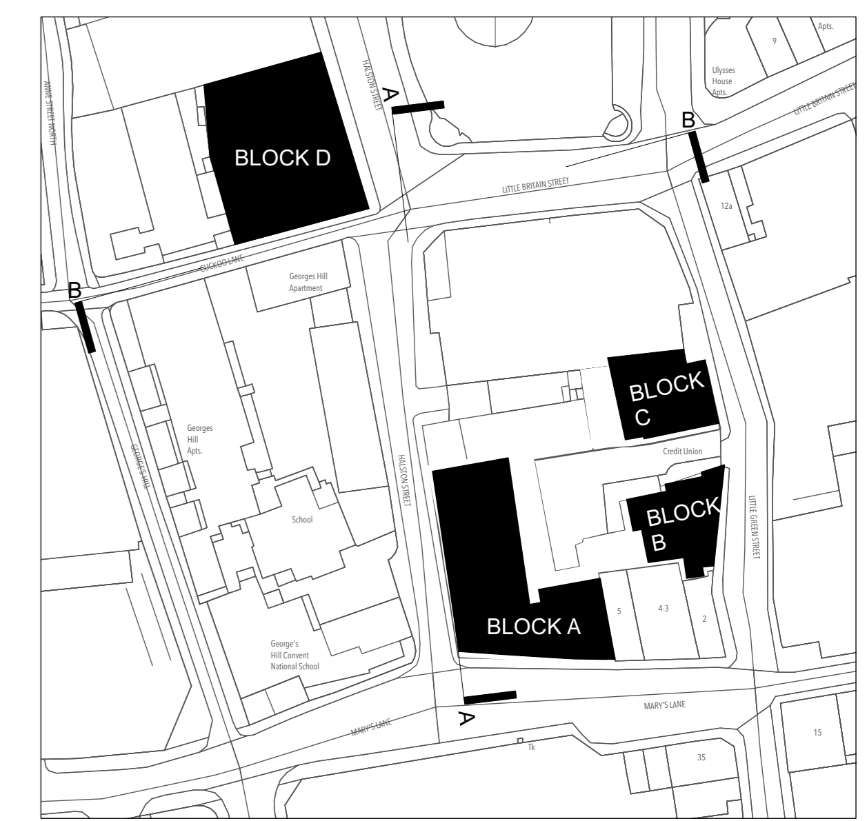
1 LEGEND Scale: 1:1000